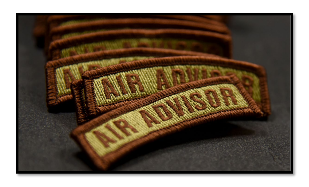
AIR ADVISOR COURSES (Held at EOS Air Advisor Academy McGuire AFB)